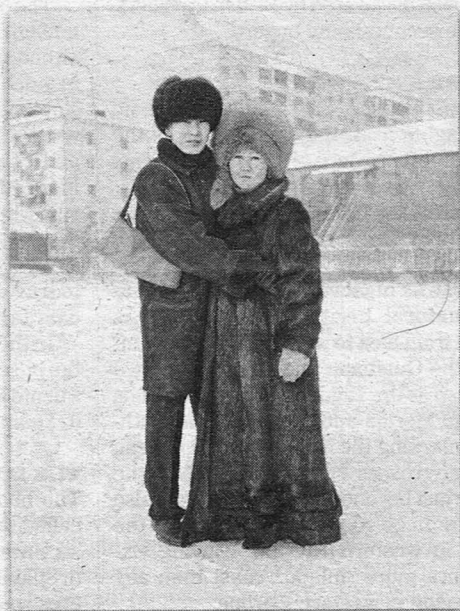
Cold comfort: a couple in Yakutsk (2004); ballroom dancers (right), Omsk (2005)

Motherland, Photofusion, 17a Electric Lane London SW9 8LA (020-7738 5774; www.photofusion.org ), 13 April-26 May