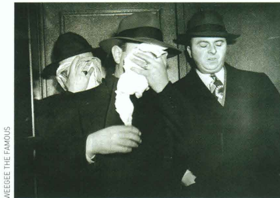
WEEGEE THE FAMOUS