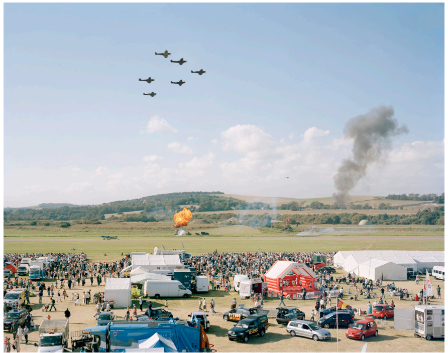
Battle of Britain Memorial Flight, Shoreham Air Show, West Sussex, 15 September 2007

The work in the exhibition ranges across various projects, from single photographs made around the time of Roberts's major photographic project We English , to his subsequent work as the official artist of the General Election of 2010, and his series National Property: The Picturesque Imperfect .