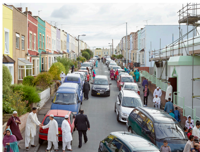
Clockwise from Top Left: Broadstairs Dickens Festival, Isle of Thanet, 19 June 2008 National Campaign Against Fees and Cuts, Parliament Square, London, 9 December 2010 Eid al-Fitr Celebrations, Jamia Mosque, Green Street, Bristol, 8 August 2013 Grenfell Tower, North Kensington, London, 19 June 2017