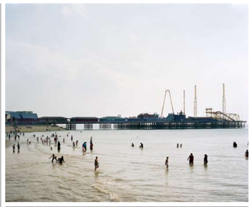
Left, from top Blackpool South Pier; Saltburn pier in North Yorkshire; Cromer pier in Norfolk. Right Llandudno pier, north Wales, one of the best surviving examples of cast-iron piers

Llandudno pier is delightful, with its kiosks like miniature pagodas